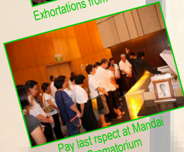
Pay last respect at Mandai Crematorium