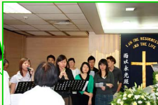
Our Young People Leading The Call To Worship